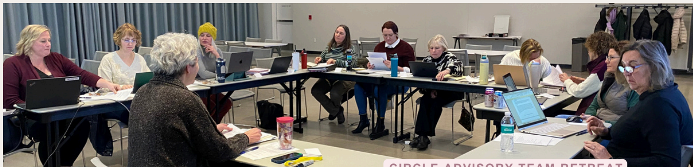
CIRCLE ADVISORY TEAM RETREAT

A Fund of the Eau Claire Community Foundation