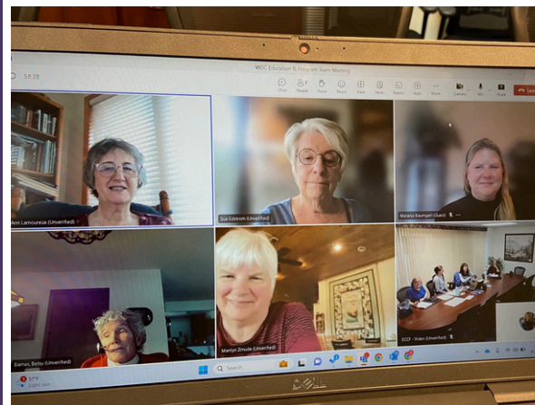
Recent Education Team meeting to discuss last minute details for the Spring Gathering.

The Education Team has been hard at work planning the Spring Gathering set for May 13th at The Brewing Projekt. They have coordinated with the non-profits that will be sharing their stories as well as planning great food choices for the event. This team also works on planning the Education Event which is set to occur later this Fall. The team plans the program and provides resources for the WGC membership as well as the community at large. They are tasked with finding speakers, venues and the food for the event. The Education Event is open to the general public and is a great opportunity for the WGC to share its mission of collective philanthropy for women and children. Thank you Education Team!