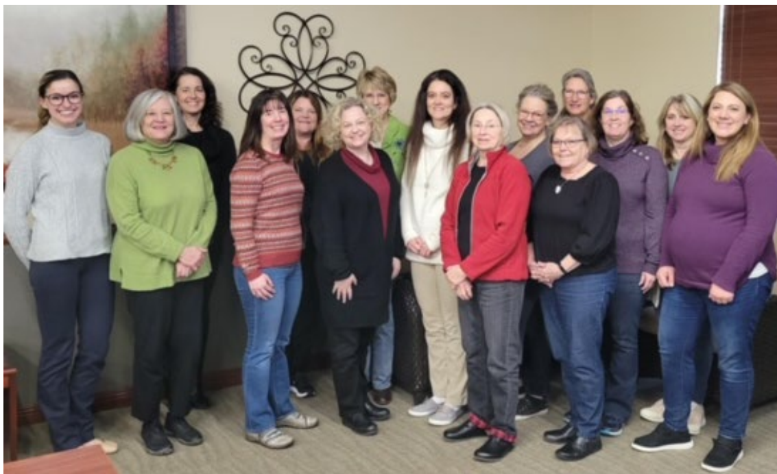
The Circle Advisory Team & ECCF Staff at the Annual Retreat, held at Bernicke Wealth Management on Saturday, January 21 st .