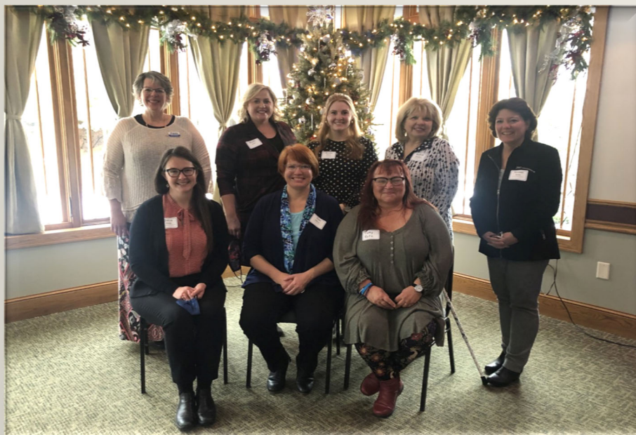
2021 WGC Grant Recipients at December's Gift of Giving Breakfast